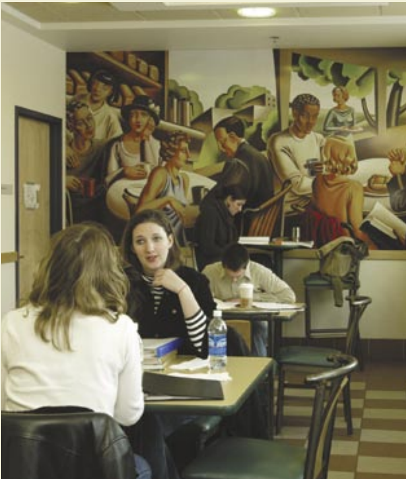
Park Library's café, which served over 40,000 guests during the fall semester, has become a popular place to meet old friends and make new ones. While two of its top sellers are hot chocolate and caramel macchiato, the café also offers parfaits, salads, wraps, pastry, and sushi.